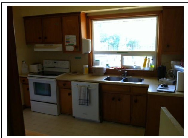
Above left: The kitchen before the renovation

So, if you're in the neighborhood, drop in for a chat, a cup of tea, or maybe just for a rainshower - you're always welcome!